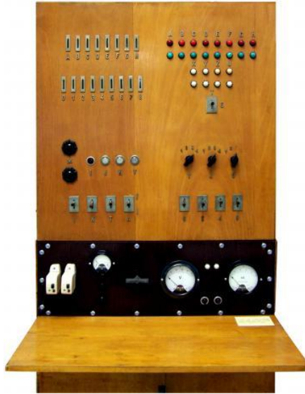
Figure 2: The Kalmár's logical machine